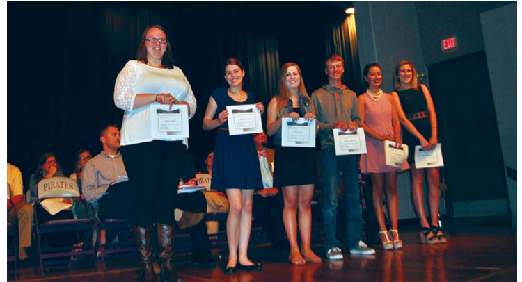
Students from Belton High School's graduating class of 2015 receive scholarships from Cass Community Health Foundation.

These scholarships are made available by charitable contributions designated to CCHF. More information about scholarships can be found at theresearchfoundationkc.org/CassCommunity .