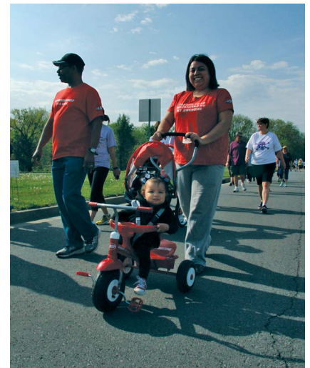
Participants walk, jog and run on the Walk for Health four-mile course that started at Belton Regional Medical Center.

The 22nd Annual Walk for Health is scheduled for Saturday, May 7, 2016. For more information or to register for the walk, visit walkforhealth2016.kintera.org .