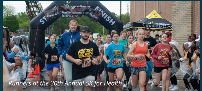
Runners at the 30th Annual 5K for Health

We announced our new safety net dental home, Cass County Dental Clinic, at 1000 E. Markey Parkway in Belton. Our groundbreaking event hosted community leaders and stakeholders on May 15, 2024, where we launched our capital campaign to raise funds for the new building. This new location will allow us to increase our clinical space and increase access for quality, compassionate dental care for underserved children and teens and their families.