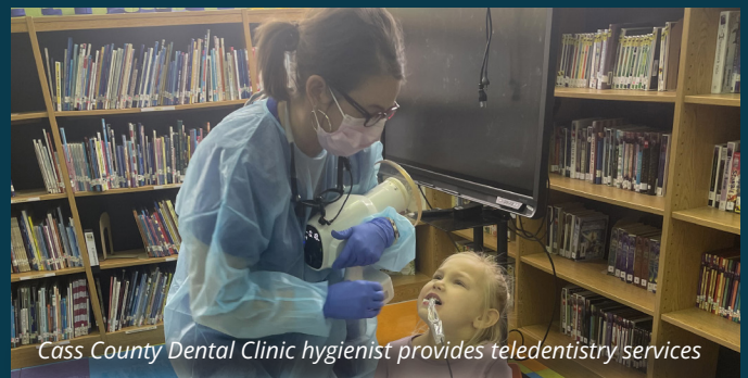
Cass County Dental Clinic hygienist provides teledentistry services

We provided free dental screenings for 6,726 students in Cass County and Grandview schools during the 2023-2024 academic year. The program was made possible by 141 volunteer dentists, dental hygienists, students, and community members, totaling 975 hours.