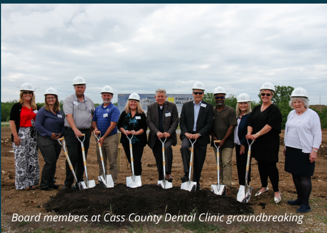
Board members at Cass County Dental Clinic groundbreaking

We provided quality dental care to 3,368 children and teens at our safety net dental clinic, Cass County Dental Clinic. The clinic increases access to oral health care by treating children and teens who otherwise couldn't afford treatment. Two locations are available in Belton, Missouri and Harrisonville, Missouri for patients ages 0 to 20.