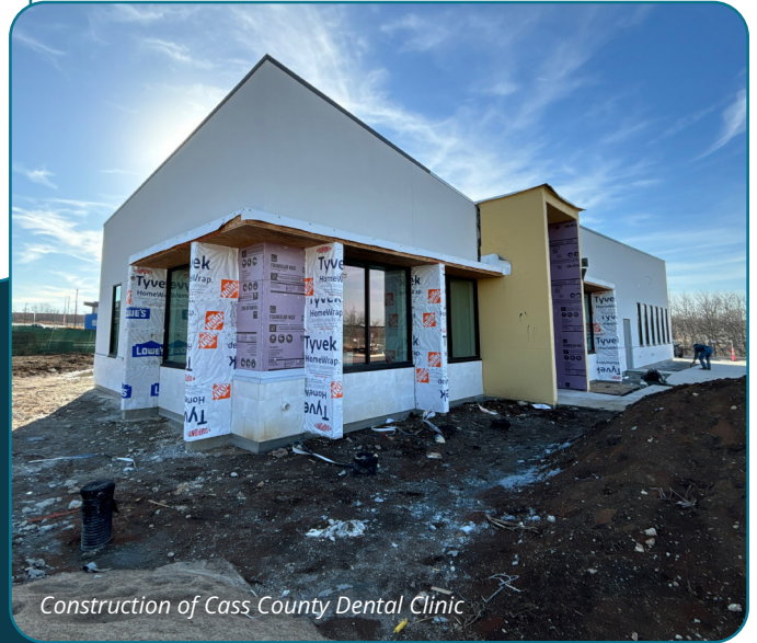
Construction of Cass County Dental Clinic

Cass Community Health Foundation opened Cass County Dental Clinic in Belton, Missouri in 2011 to provide comprehensive oral health services for children and teens who are insured by Medicaid or from underserved backgrounds. The demand for services has exceeded our capacity. As a result, we launched a capital campaign in 2024, A Lifetime of Smiles, and broke ground for the clinic's future home at 1000 E. Markey Parkway in Belton, Missouri.