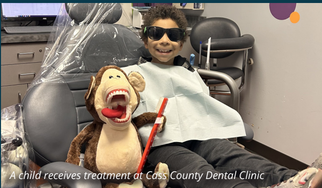
A child receives treatment at Cass County Dental Clinic