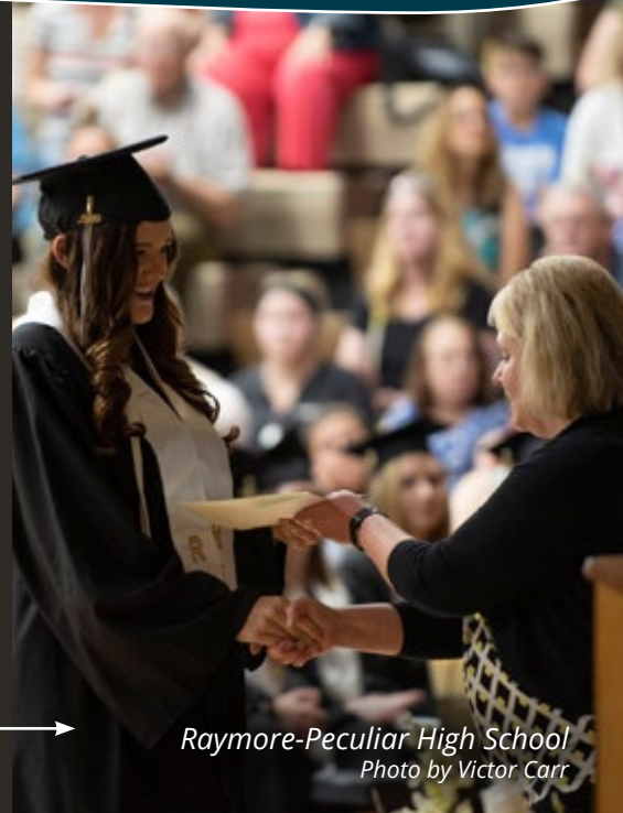
Raymore-Peculiar High School

In 2019, Cass Community Health Foundation awarded $52,250 in scholarships to 40 high school seniors from the Cass County and Grandview area who are pursuing careers in health care.