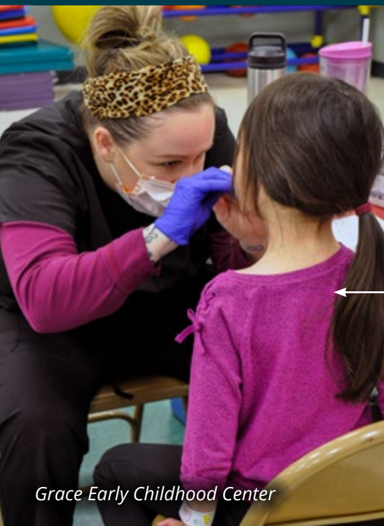
Grace Early Childhood Center

The 5K will begin and end at Belton Regional Medical Center. Check-in begins at 7:30 a.m. and the 5K begins at 8 a.m.