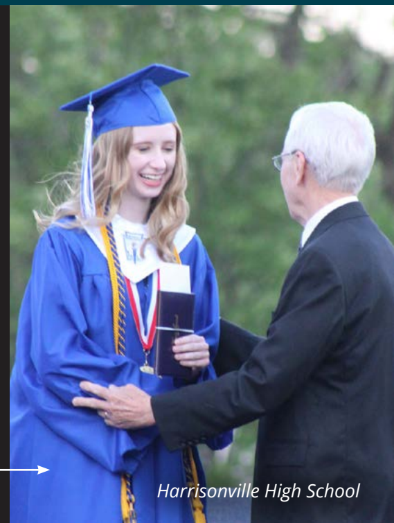
Harrisonville High School

In 2018, Cass Community Health Foundation awarded $30,000 in scholarships to 25 high school seniors from the Cass County and Grandview area who are pursuing careers in health care.