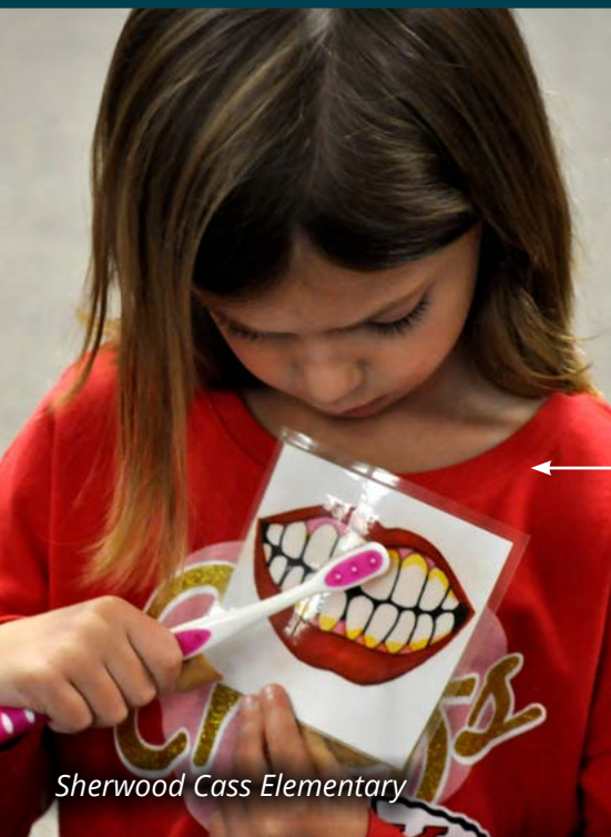
Sherwood Cass Elementary

Help us reach our goal of $70,000! You can gather your friends, family or coworkers and create a team that raises donations to support your participation. Are you a runner? Register for the timed 5K race! If you can't attend the 5K, just donate. Every contribution helps kids in Cass County!